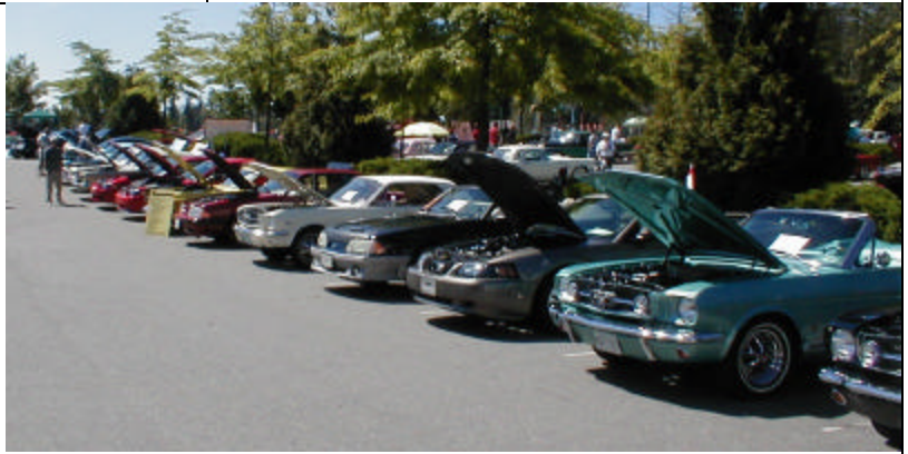
Mustangs galore...It's easy to see why the GVMA had best club turnout.