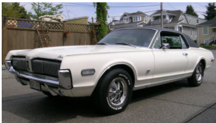
What a stand-out. Crisp Polar white with a black vinyl roof

NEXT NEWSLETTER DEADLINE IS: June 15th, 2004