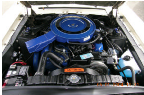
The wonderfully detailed 390 2V X code engine