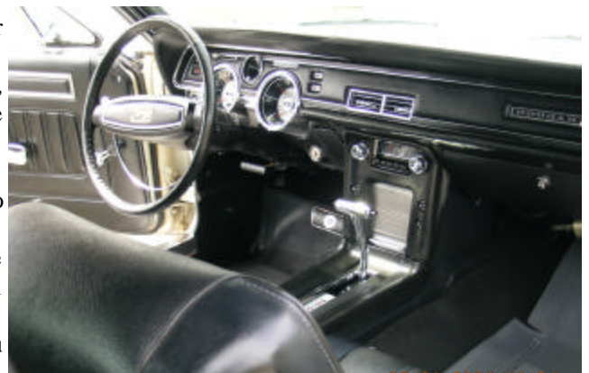
This car's black vinyl interior is assembly line perfect.