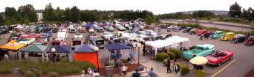
The Galaxie Club show was a great success.