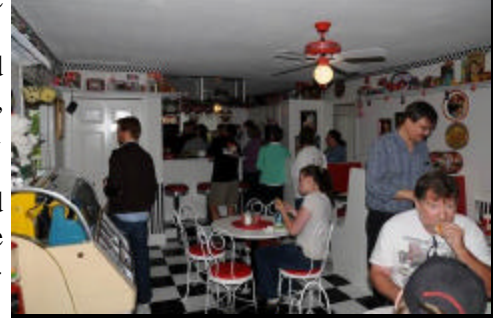
Coca Cola, Elvis, Marilyn, food and beverages were abundant in the 50's diner.

cious and we stayed for hours and hours before logic dictated we head home as Show Day was almost here and some quality rest was in order.