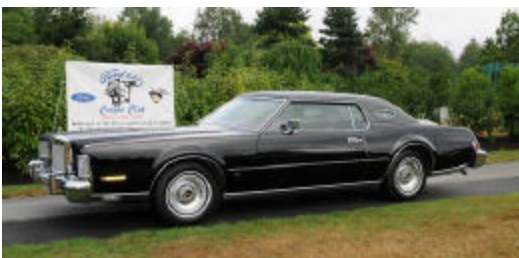
Dams Ford Lincoln displayed a Lincoln.