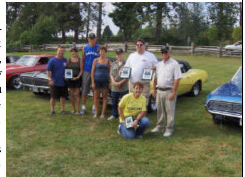
Some of the Fordnutz members at the GVMA show that won awards.

Look for my Thursday night e-mail messages which will outline upcoming events for each subsequent weekend. Give me a call at 604-591-3673 or e-mail to events@fordnutz.org if you need information, want to volunteer or have suggestions for a club activity. You can also look further ahead by logging onto Harrisons List at www.autoeventlist.com or the Goodguys Event Info at www.goodguys.com .