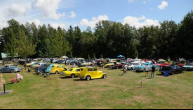
Some of the 100 vehicles entered into our Claw In.

Sunday dawned overcast but warm as the Claw In work crew left their homes for our new venue