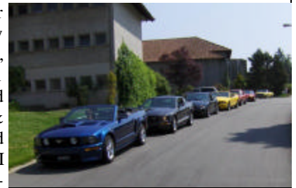
The Canada Day cruisers at the Mission Abbey.