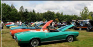
A row of Cougars & Mustangs.