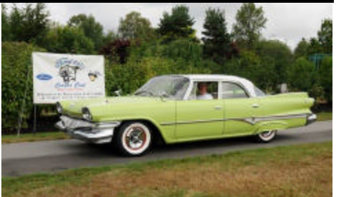
Jeff Bingaman’s 60 Dodge Phoenix.