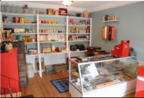
Audrey's replica drygoods store.