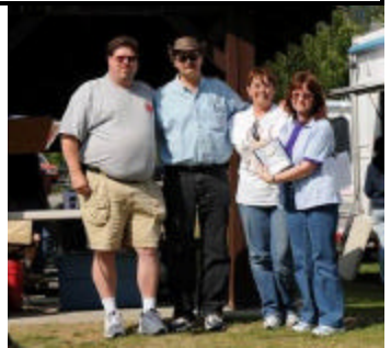
Rob Waine Memorial award.