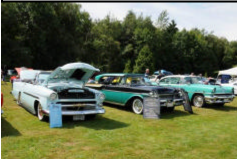
Some very nice big Mercs.