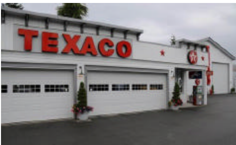
The theme of the day seemed to be replica gas stations like the Stebanuks' Texaco.

Tearing ourselves away from Harold's fascinating stories, we headed off to our next stop a little further east and south,