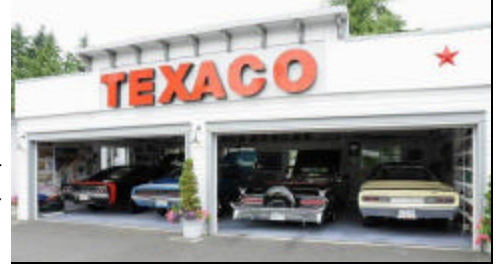
Everyone was quite impressed with the muscle in the garage attached to the store.

rage with four heavy duty 60's muscle cars in residence. Next we were invited into the garden where a big pond stocked with huge koi is nestled amid rock gardens and the constant sound of trickling water. Last but by no means least, Audrey invited us into their home where one area has been fashioned after a fifties diner complete with booths, juke box, pinball machine and ...lunch. What a great surprise to see cold drinks and platters of meats, cheeses, buns, fresh fruit and sweets. It was a perfect end to our tour, a chance to sit down, mingle with our friends and quiet those hunger pangs before heading off to get ready for the annual club dinner. Audrey also took interested parties through her house where she pointed out the features of her self-designed kitchen and home-made drapes.