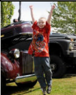
Jumpin’ for joy.