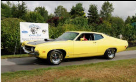
Rich Chalke’s cool 70 Torino Cobra.